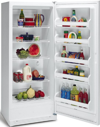
Under Refrigeration Below 41°F