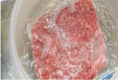
Under Running Water Below 70°F