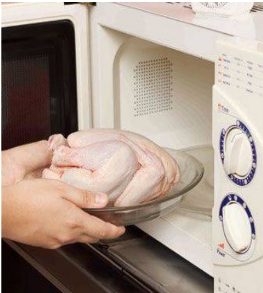
Microwave and Immediately Cooked