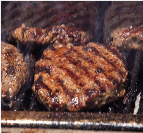
Part of the Cooking Process