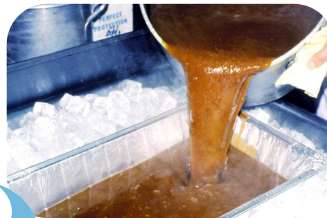
3 Shallow Pans (not deeper than 2 inches)