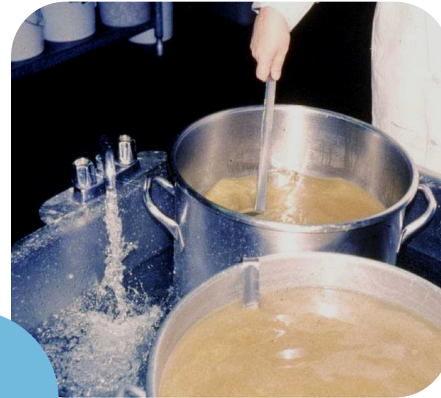
1 Ice Bath