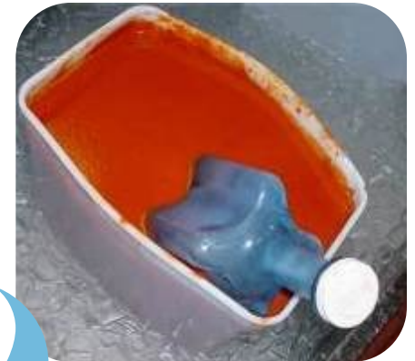
2 Ice Wand