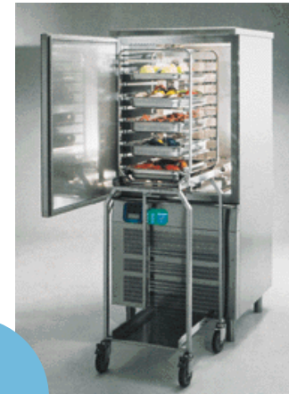
4 Blast Chiller