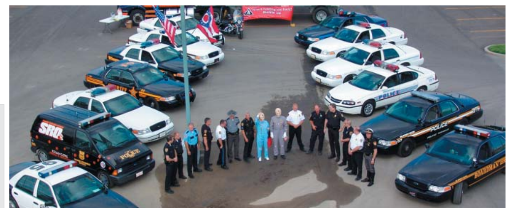
What's Holding You Back?/Click it or Ticket campaign Kick Off