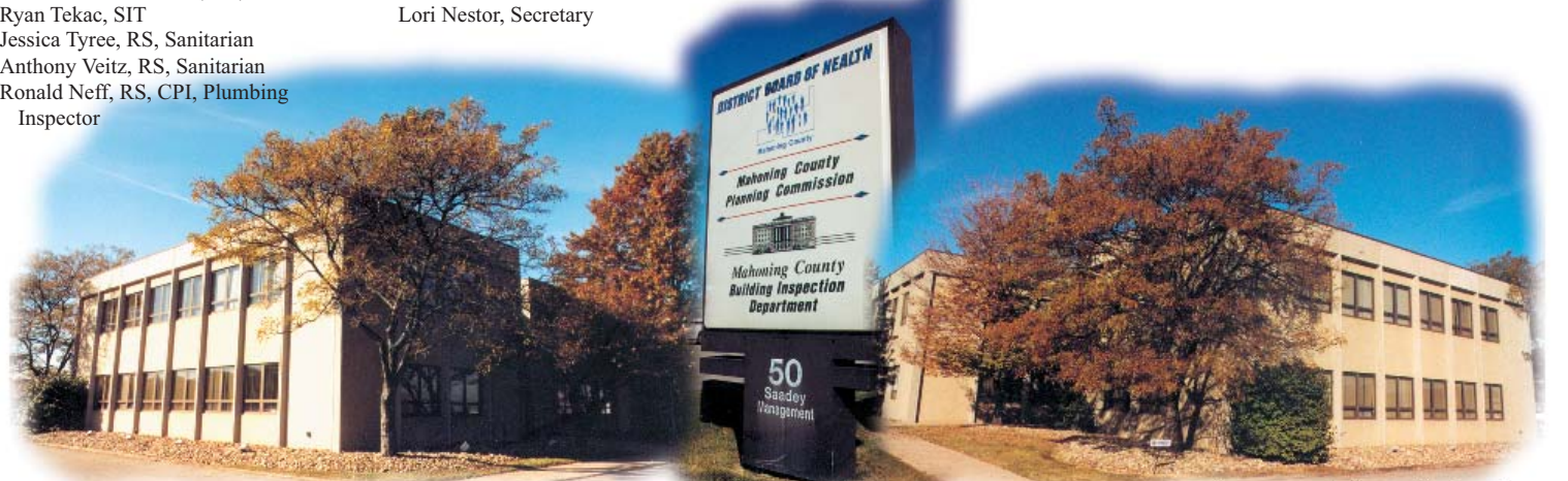
Equal Provider of Services and Equal Opportunity Employer