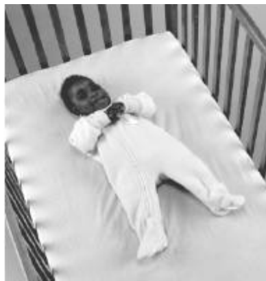
An infant in a safe sleep environment

Bedding and sleep surfaces - The Board has reviewed several infant deaths in which a parent fell asleep with an infant on a couch or sofa. IT IS VERY DANGEROUS TO PLACE AN INFANT ON A COUCH OR SLEEP WITH AN INFANT ON A COUCH, ARMCHAIR OR WATERBED – NO ONE SHOULD SLEEP WITH AN INFANT, ESPECIALLY ON THESE SURFACES.